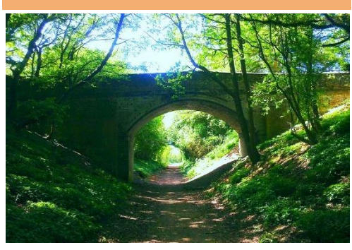
The River Lea

Sheepcote Lane goes under the B653, but for our route turn left just before the road. Then follow the winding path along the river Lea to Waterend.